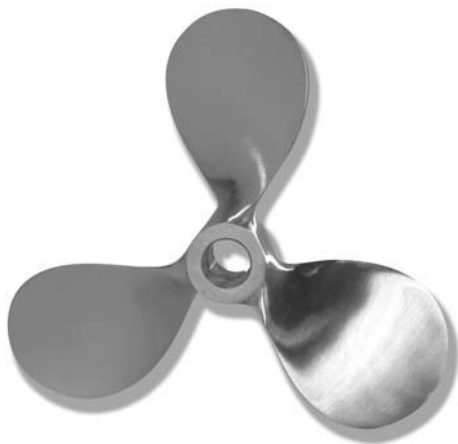
Michigan MP-Style Stainless Steel

For Stainless Steel 2 and 3-blade weedless propellers, contact Michigan Wheel Division, Quality Castings at 1-866-664-5443.